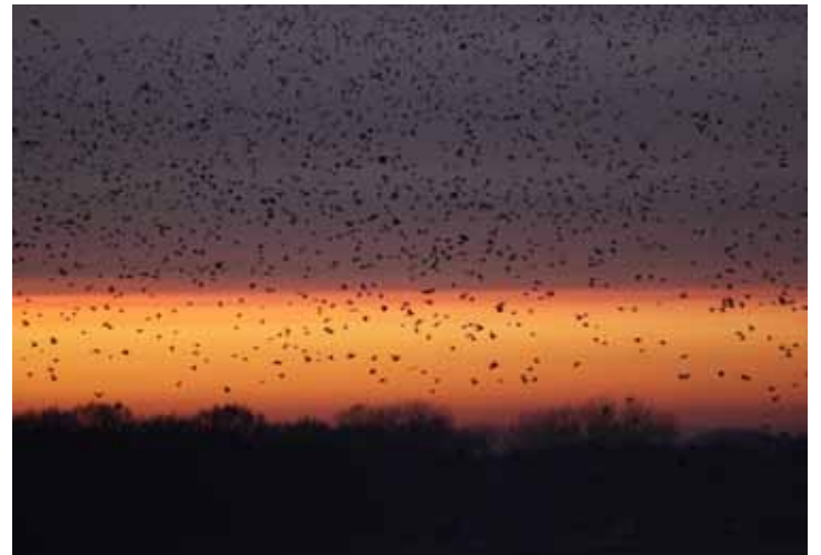
Rooks heading to their roost at Buckenham Carrs

The tides, which back up the River Yare twice a day as far as Norwich, still allow salt-loving fish to flourish even in the city. Those flounder are now one of the few indicators that the Yare's entire lower valley, including the marshes at Claxton, was once an arm of the North Sea, known to the Romans as Gariensis.